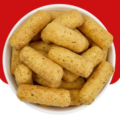
Low Sodium Chickpea Puffs