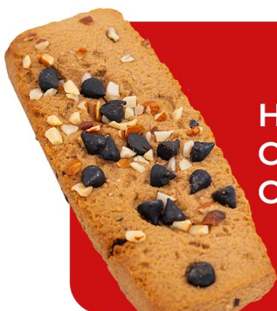
High Protein Choco Almond Cookie Bar

Fuel your day with Almond ChocoChip & Cashew Raisin Protein Bars . Packed with plant-based protein , made without maida or processed sugar, for clean and convenient nutrition on the go.