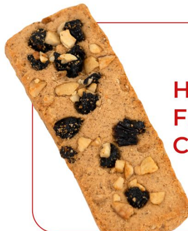
High Protein Fruit & Nut Cookie Bar