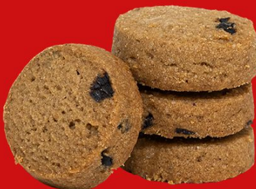
Short Bread Bites Chocochips