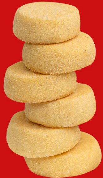
Short Bread Bites Butter Vanilla