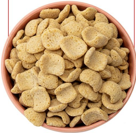
No Fat Protein Power Bytes