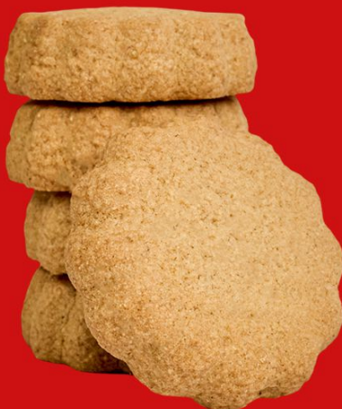
Gluten Free Cookies